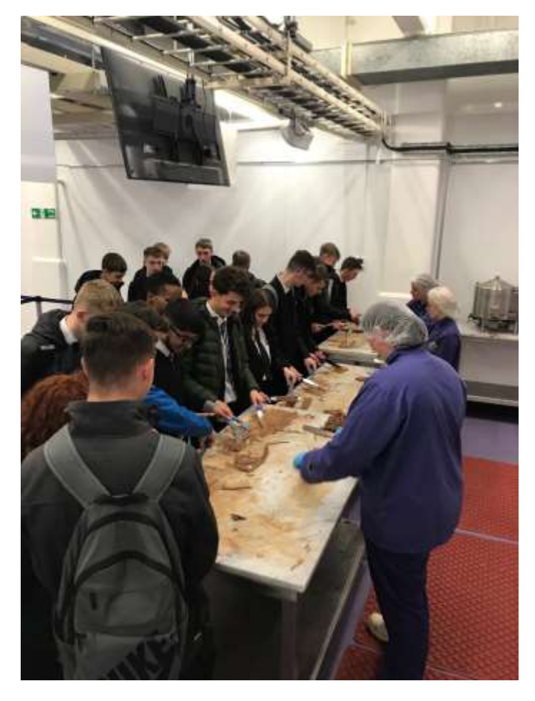
Enrichment Business visits or guest speakers