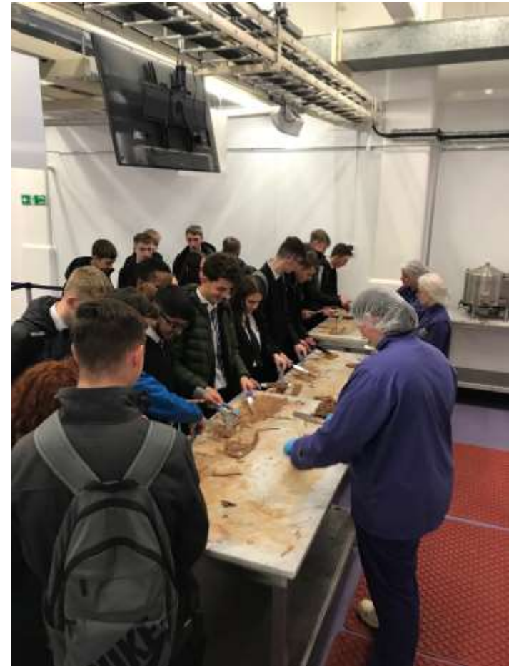
Enrichment Business visits or guest speakers